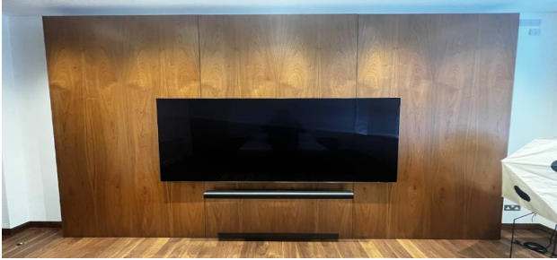
Sloane Square — Chelsea