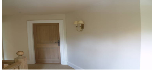
Tuddenham — country house