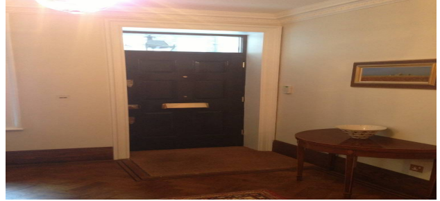
Westminster — London