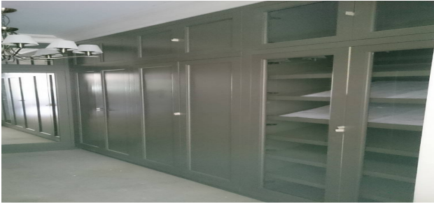
Kent — country house